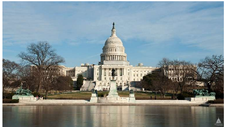
The US Capitol Building in Washington, DC

The U.S. federal government has three branches: Executive , Judicial , and Legislative . The Legislative branch is called Congress . It is responsible for making the laws of the country. Congress is divided into two chambers: the House of Representatives and the Senate .